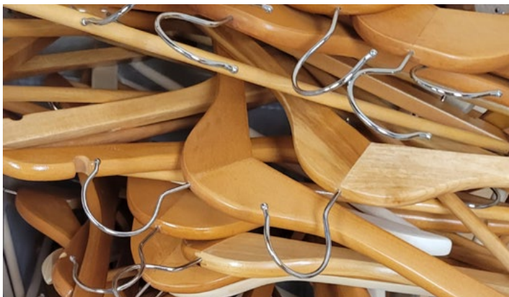
Empty hangers waiting to be full!