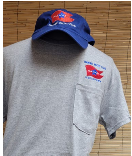
The new pocket tee shirt.