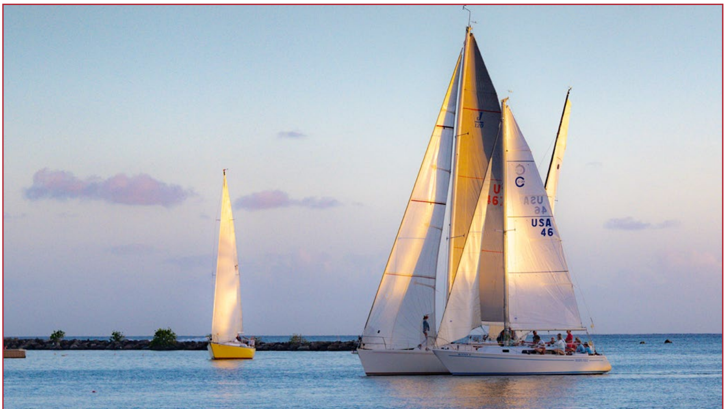
Sun setting on our racers; Friday, March 29, 2024