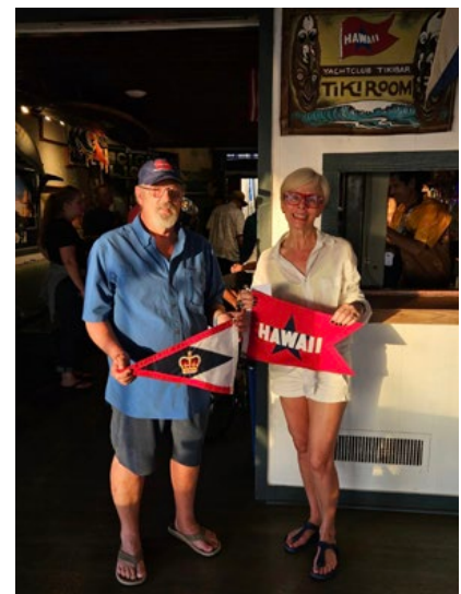
Burgee exchange with Royal Victoria Yacht Club March, 2024