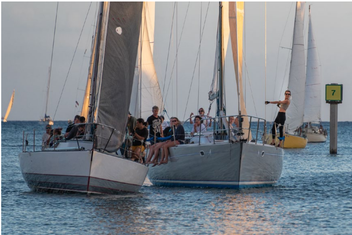
Traffic jam in the channel; Friday, March 29, 2024