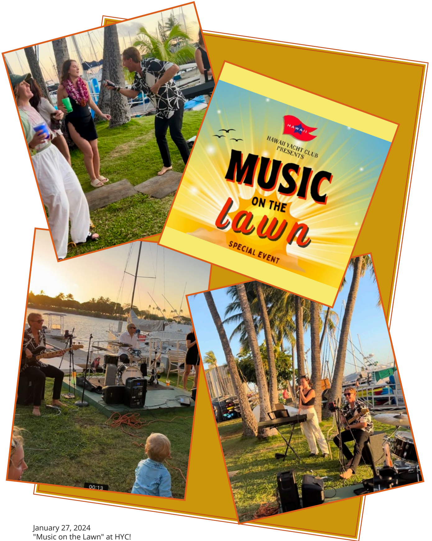
January 27, 2024 "Music on the Lawn" at HYC!