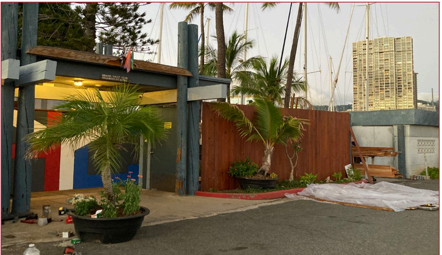
New fence installation at HYC!