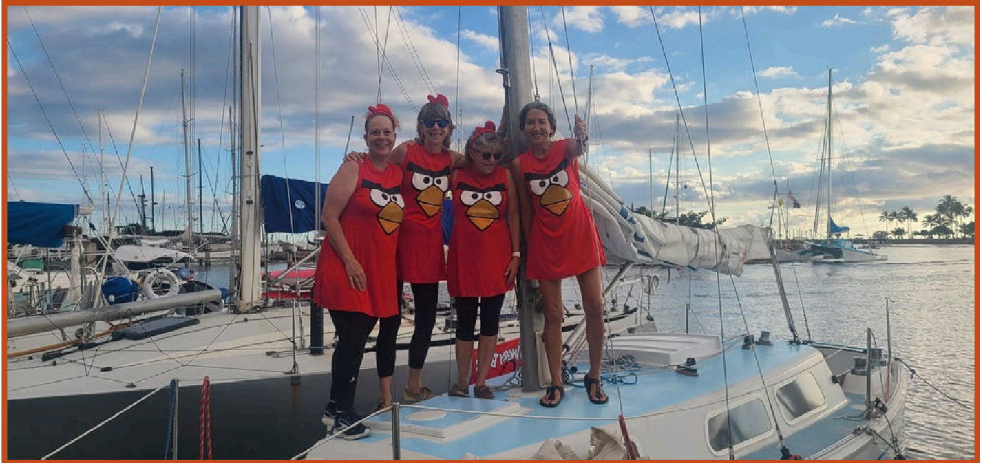
Congratulations to First Place winners in this year's costume contest: The crew of Born Free (the Angry Birds!)