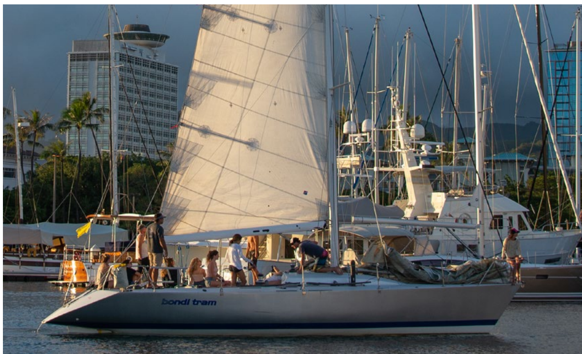
S/V Bondi Tram heading out on her last Friday night race; November 3, 2023. She will be missed!