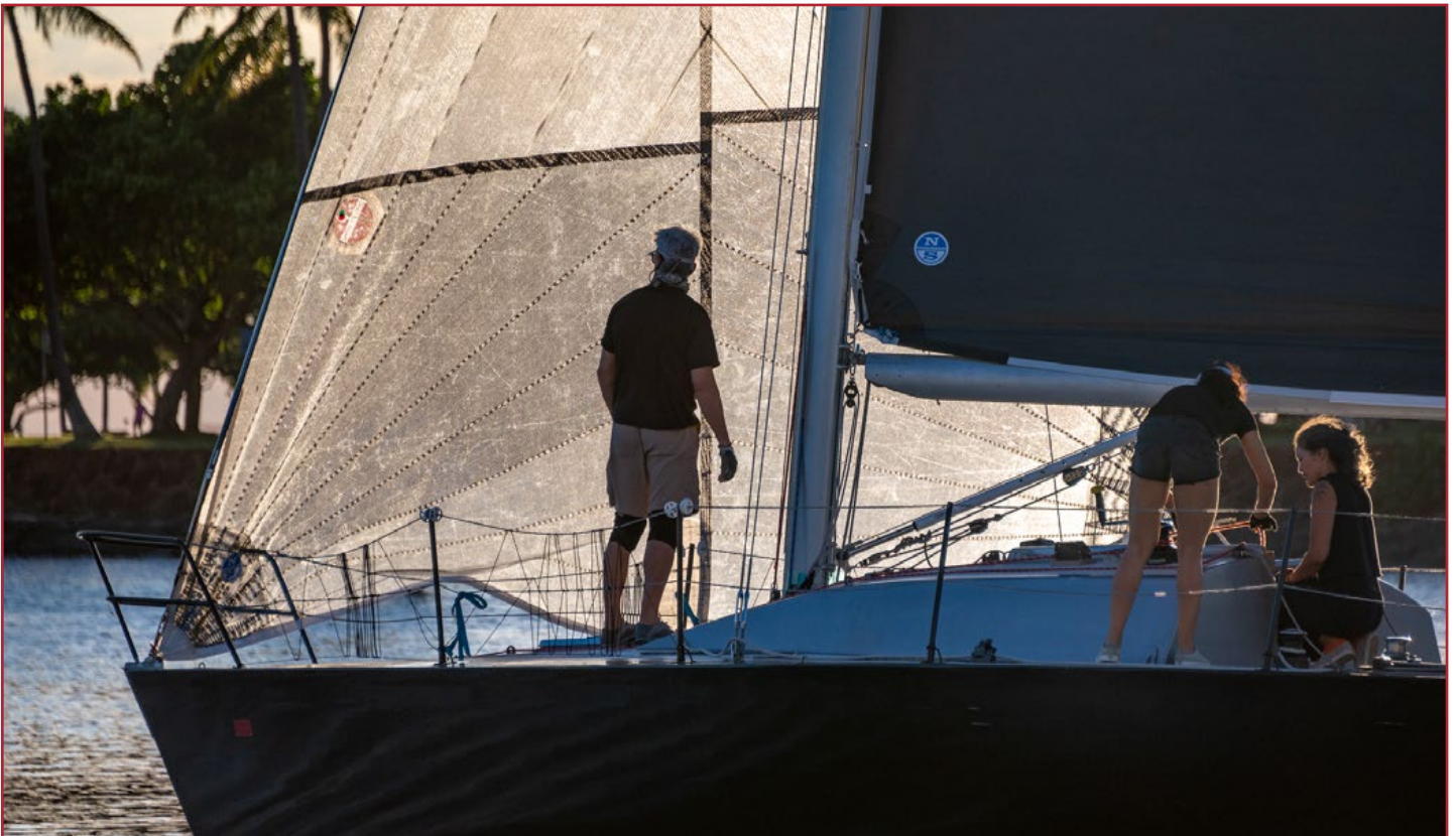
S/V Country Boy heads out for a Friday night race.