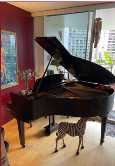
The baby grand piano (said to be from a pub in England).