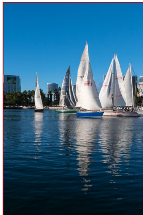
Aloha Friday; January 27, 2023