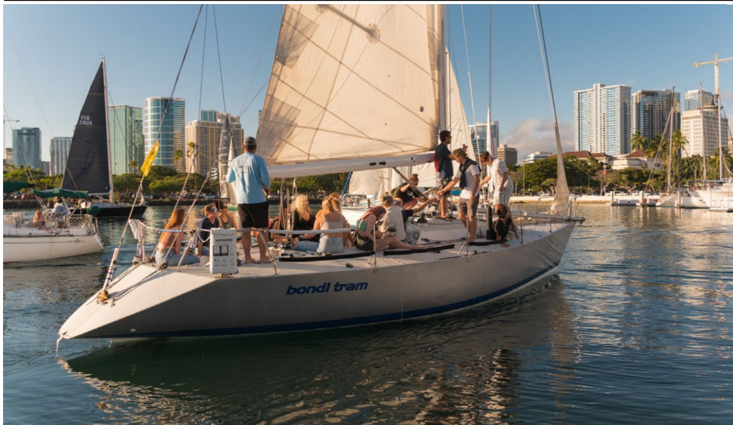
Aloha Friday; January 27, 2023.