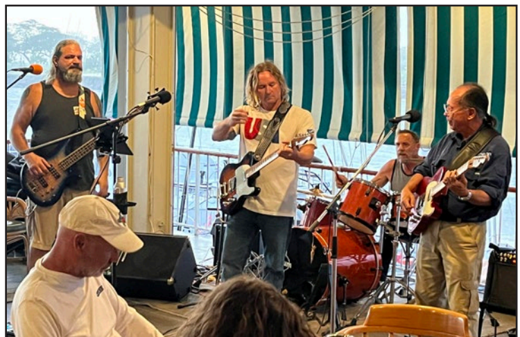
Old School playing at HYC during this year's Superbowl party.