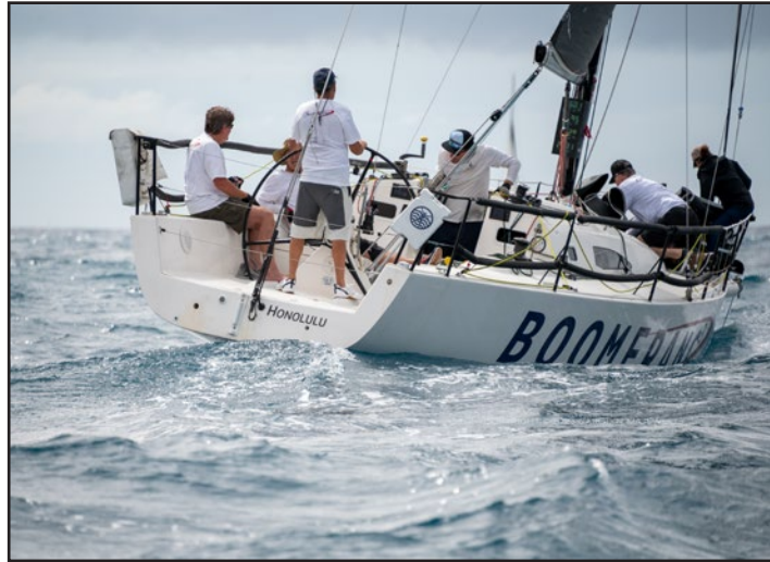
S/V Boomerang