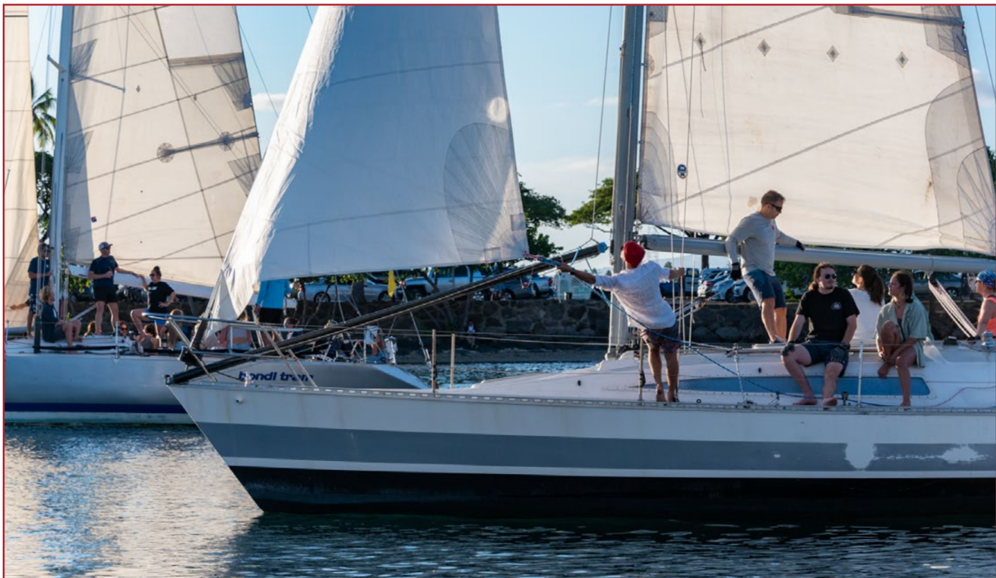
Friday night race. S/V Quicksilver and S/V Bondi Tram.