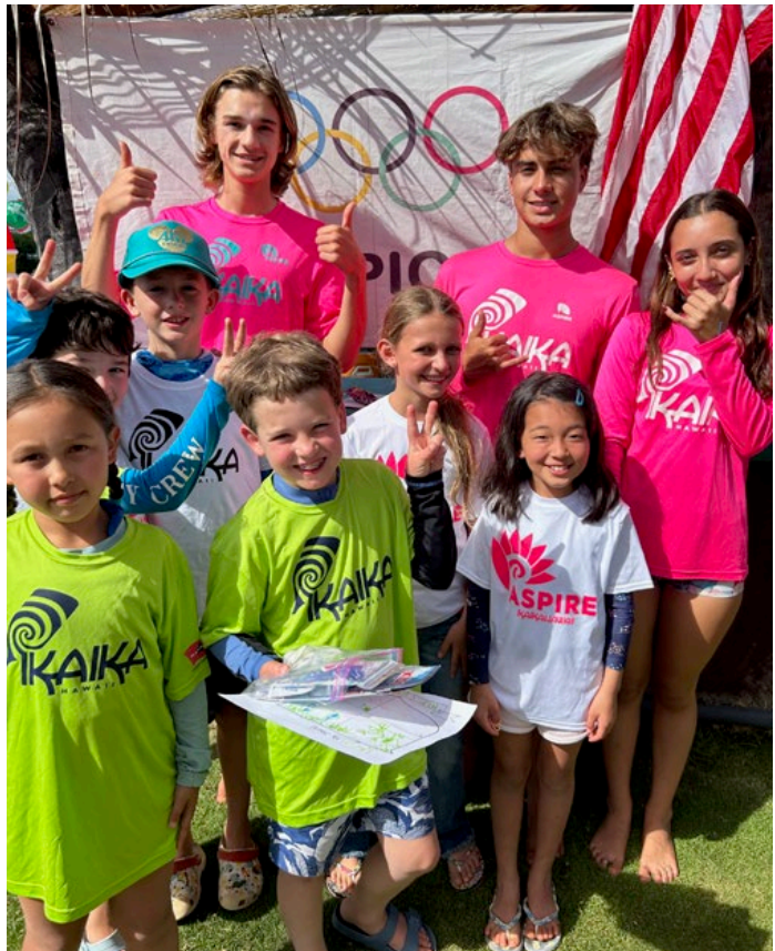
Top left: Our next generation of HYC Ikaika waterman heading out on our new Vice Commodore's boat to prepare for a life enjoying our oceans.