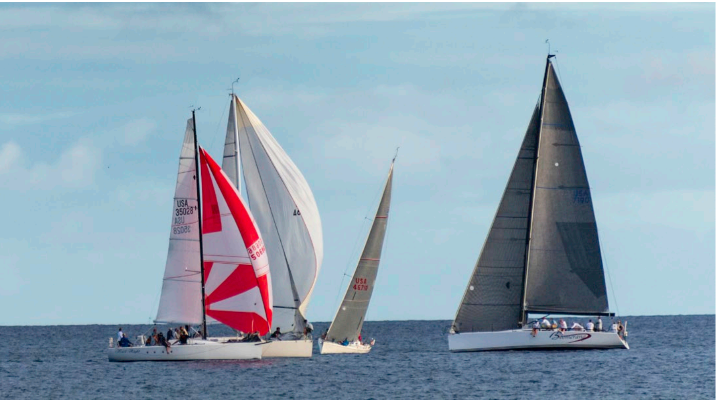
Friday night race; April 30, 2021