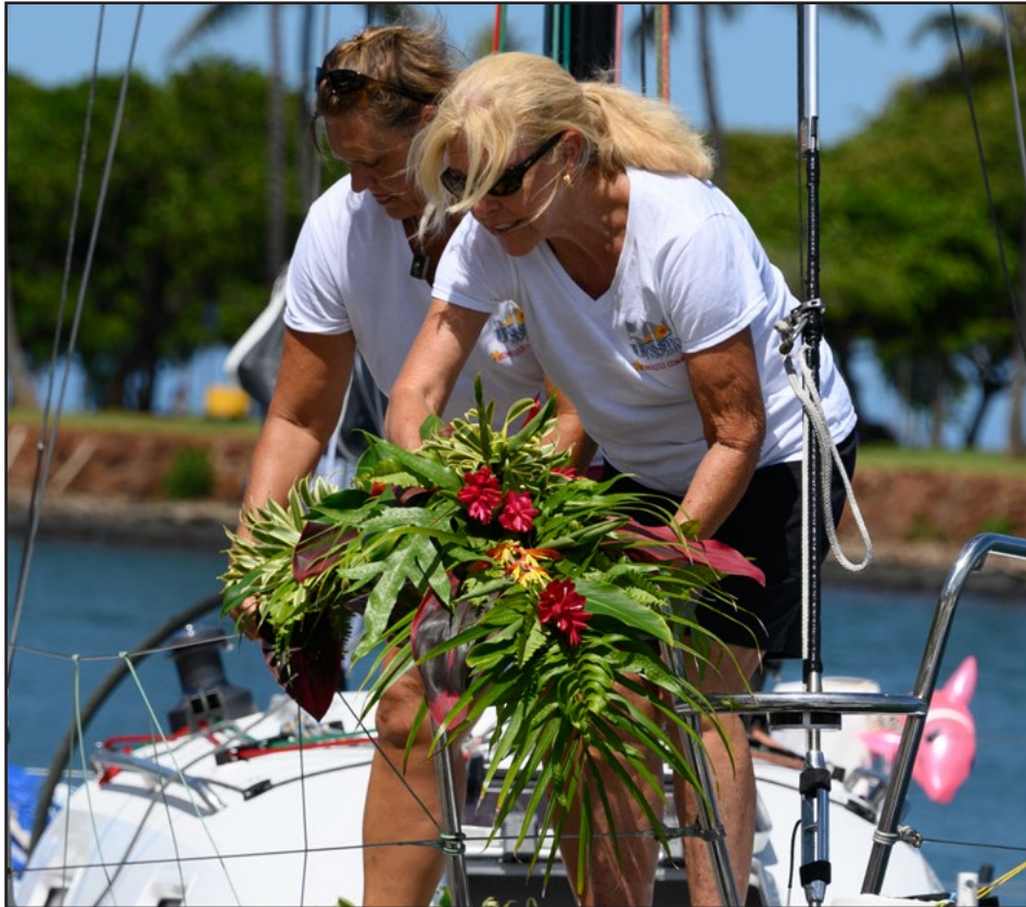
Transpac Memories! July 21, 2019; Photo credit: Carolyn Majewski