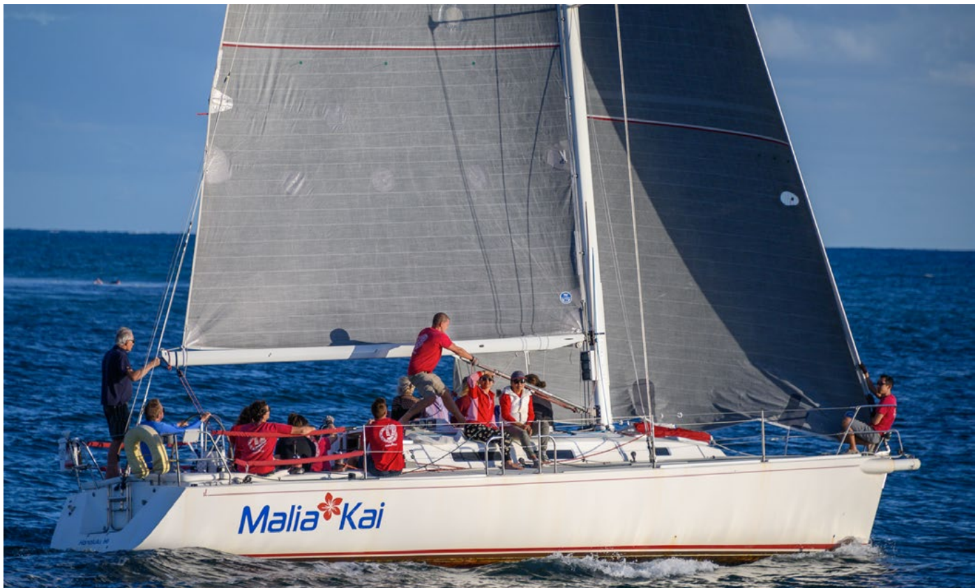
Ready to race!